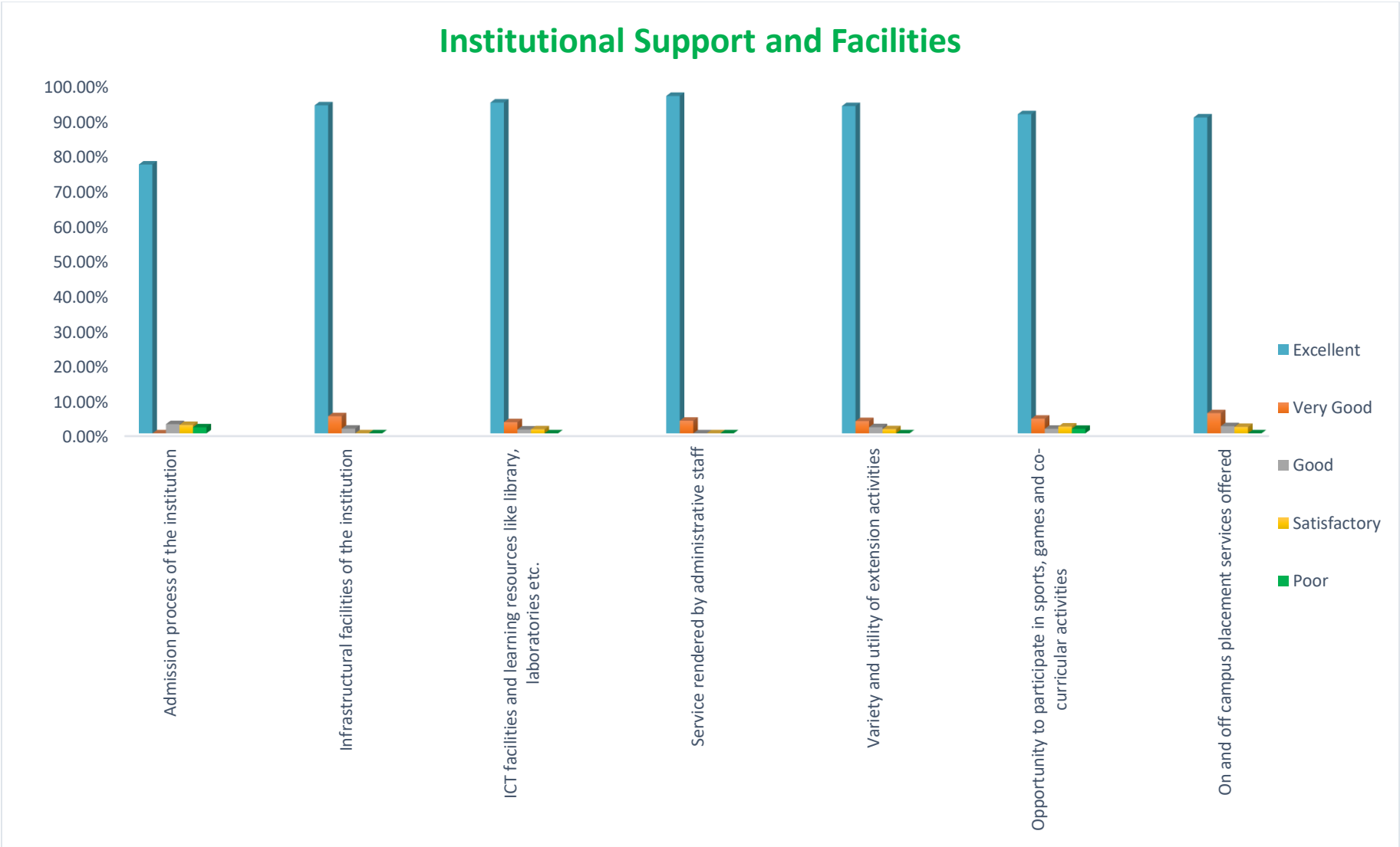
Figure 2: Results of the feedback of Students on Institutional Support and Facilities